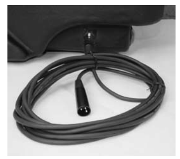
XLR CABLE TO HOUSE PA